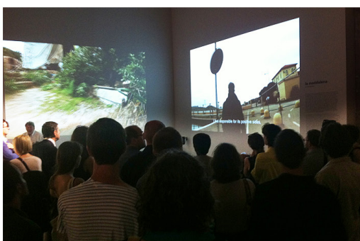
La Maddalena, Venice International Architecture Biennale - Venice