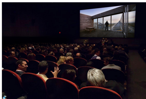
The Infinite Happiness , ADF, New York