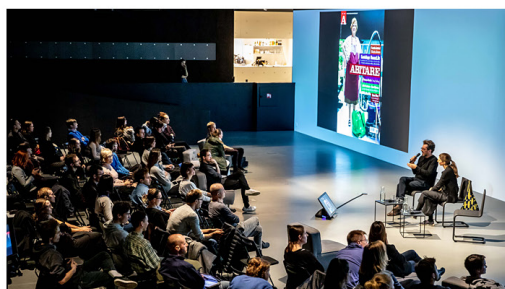
Homo Urbanus, CAMP - Praha