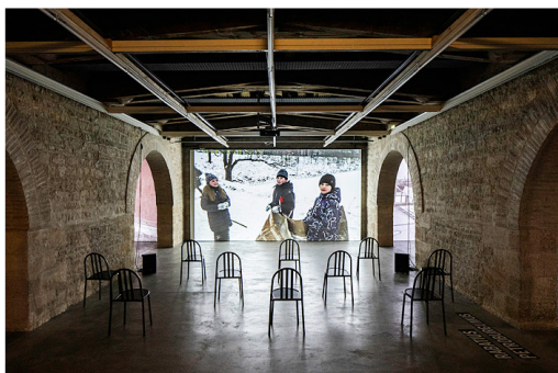
Homo Urbanus, Arc en Rêve - Bordeaux