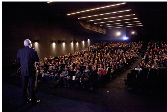
Voyage autour de la Lune , UGC, Bordeaux