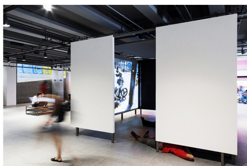
Homo Urbanus, São Paulo Architecture Biennial - São Paulo