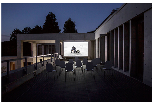
Homo Urbanus, Villa Kujoyama - Kyoto