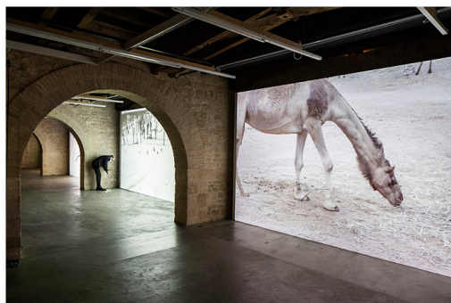
Homo Urbanus, Arc en Rêve - Bordeaux