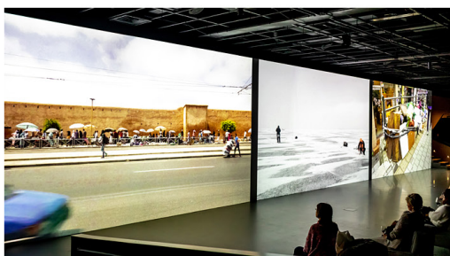
Homo Urbanus, CAMP - Praha