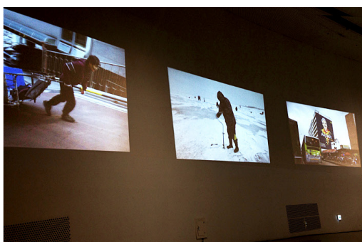
Homo Urbanus, Seoul Biennale of Architecture and Urbanism - Seoul