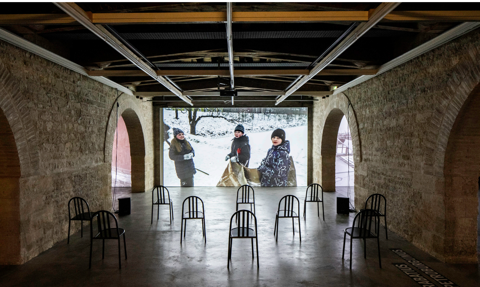
Arc en Rêve, Bordeaux, France